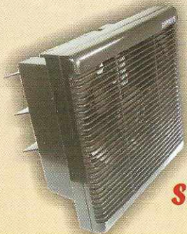
Supreme 150 mm (6")