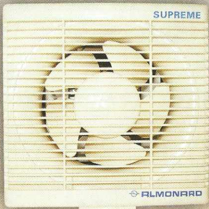
Supreme 200 mm (8")