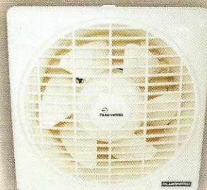
HIGH SPEED 200 mm (8")