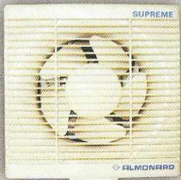
Supreme 150 mm (6")