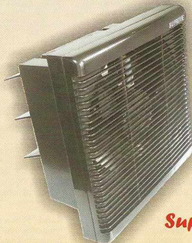
Supreme 200 mm (8")