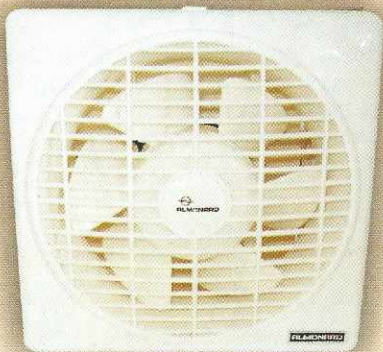
HIGH SPEED 250 mm (10")